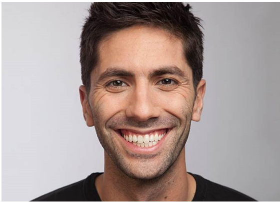
NEV SCHULMAN, OF MTV'S CATFISH

Nev Schulman has spent the last five years traveling around the U.S. as the executive producer and host of Catfish: the TV Show . The hit series was inspired by the critically-acclaimed 2010 documentary Catfish which featured Nev and his story of online love and deception. In 2014, Nev published his first book, In Real Life: Love, Lies & Identity in the Digital Age . He is a regular contributor to ATTN:, Father.ly, Glamour, and MTV.com. Nev's media appearances include Ellen , The Tonight Show , 20/20 , The View , Anderson 360 , and Chelsea Lately .