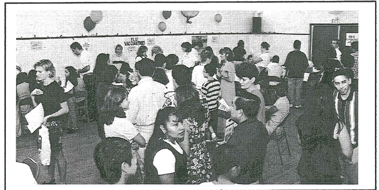
Cristo Rey Health Fair

This project grew out of a dialogue between local religious leaders, food providers, and Loyola to address issues of need in Rogers Park and Edgewater. Since the summer, participants including representatives of five Loyola departments – CURL, University Ministry, Considine Chair, Government and Community Relations,